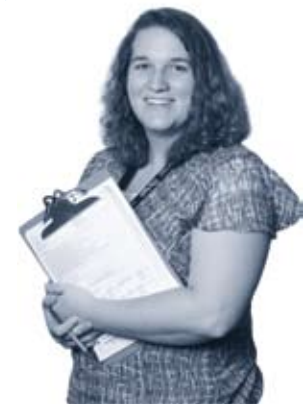
The Care Manager

Information technology (IT) systems complement the role of the care manager. IT tools include a tracking database, patient summary sheet, and electronic messaging systems. Reports are generated for ongoing assessment and administration of a care management program.