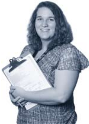
The Care Manager

disease and navigate the health care system. Information technology (IT) systems complement the role of the care manager. IT tools include a tracking database, patient summary sheet, and electronic messaging systems. Reports are generated for ongoing assessment and administration of a care management program.