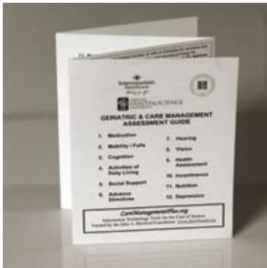
Care Management Plus provides a variety of printed and virtual tools to assist both doctors and older patients in managing complex health conditions.